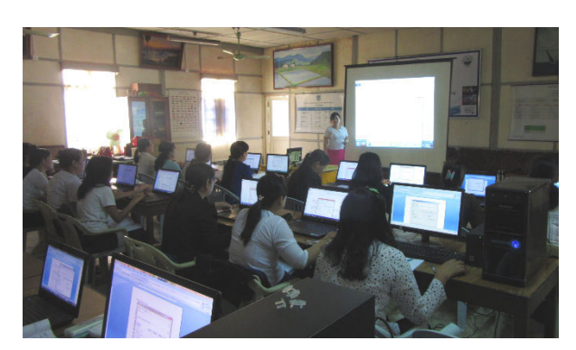
Computer training at IFT