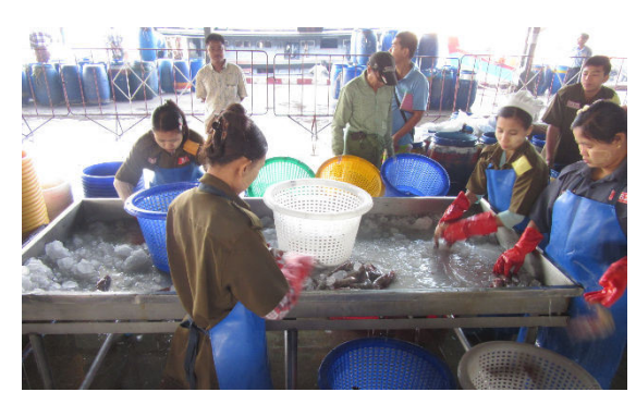
Sorting of fish at an EU certified landing site