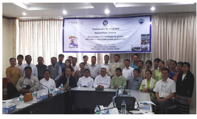
The first stakeholder meeting with fish farmers

The next step of MyanMed Project is to carry out field surveys for both aquaculture farmers and artisanal fisherment to map the needs of technology an the demand of training at grassroot level.